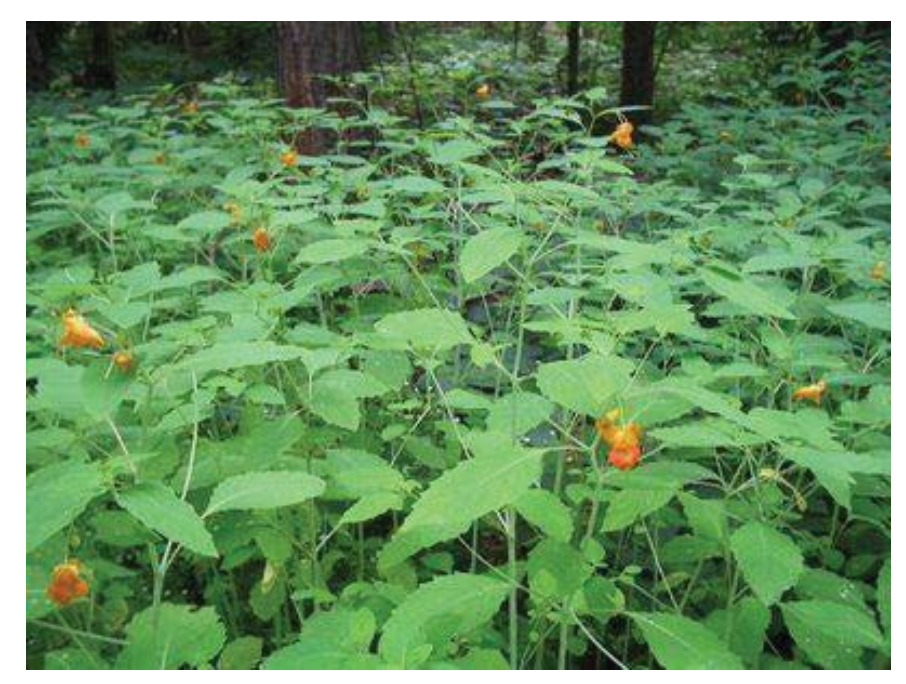
Impatiens capensis (Jewelweed)