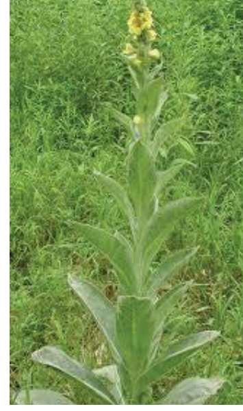
Verbascum thapsis (Mullein)