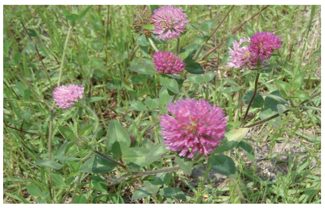
Trifolium pratense (Red Clover)