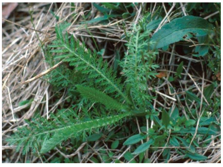
Achillea millefolium (Yarrow)