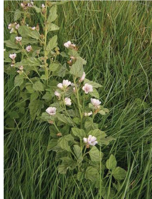
This is the real Althea officinalis (Marshmallow)