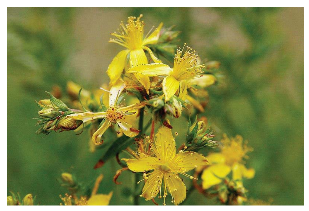
Hypericum perforatum (St. John's Wort)