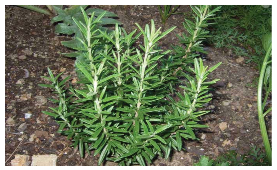
Rosmarinus officinalis (Rosemary)