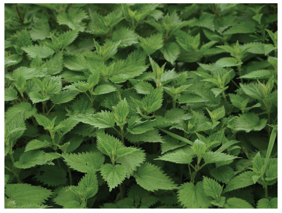
Urtica dioica (Stinging Nettle)