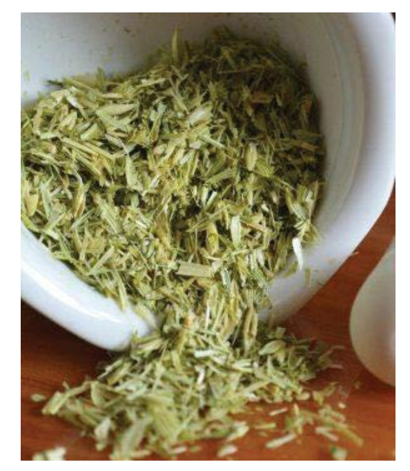
Avena sativa (Oatstraw)