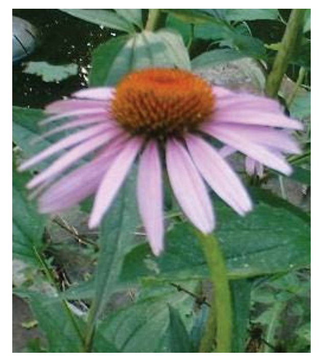
Echinacea purpurea (Echinacea)