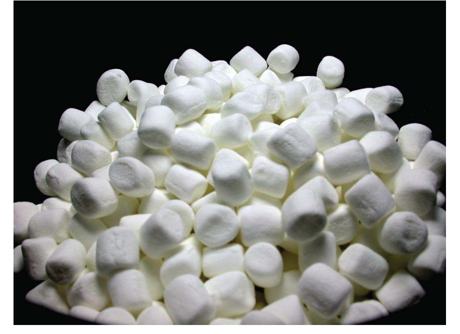
Marshmallows we love to toast around the camp fire. These actually used to be made with the plant by the same name, marshmallow!

Leonurus cardiaca (Motherwort)